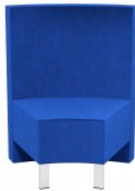
Snake 45 Degree Corner Section with Backrest on Longer Angle