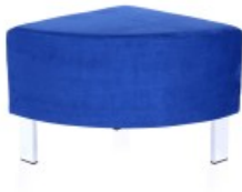
Snake 90 Degree Corner Section