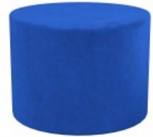
Snake Round Backrest