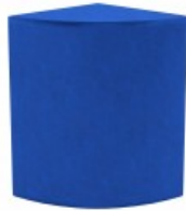
Snake 90 Degree Corner Section Backrest