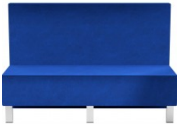
Snake Rectangular Seater with Backrest, 1500 mm Wide