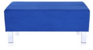
Snake Rectangular Seater, 1000 mm Wide