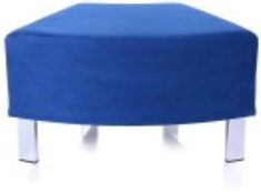
Snake 45 Degree Corner Section