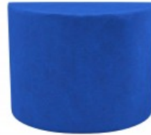
Snake D-Shape Shape Backrest