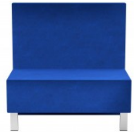
Snake Rectangular Seater with Backrest, 1000 mm Wide