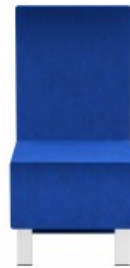
Snake Square Seater with Backrest