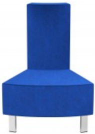
Snake 45 Degree Corner Section with Backrest on Shorter Angle