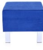
Snake Square Seater